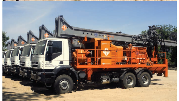
Mounted as standard on a 6 x 6 or 8 x 8 truck for quick mobilisation between sites of long distance.