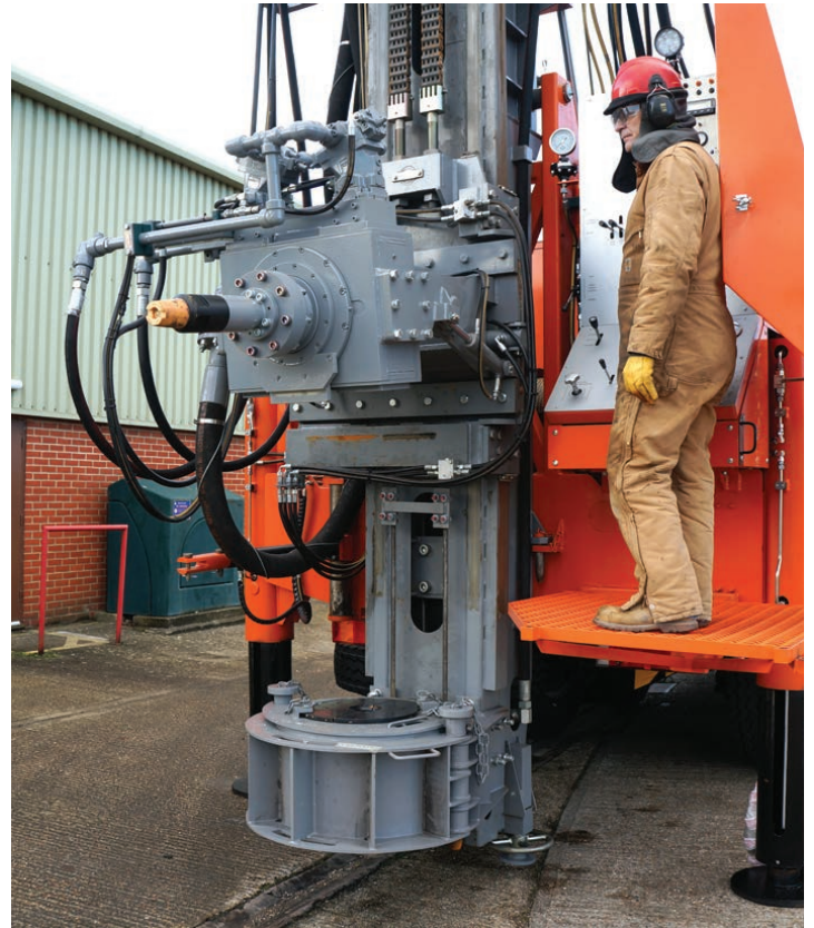
High torque rotary head with hydraulic side shift and head tilt.