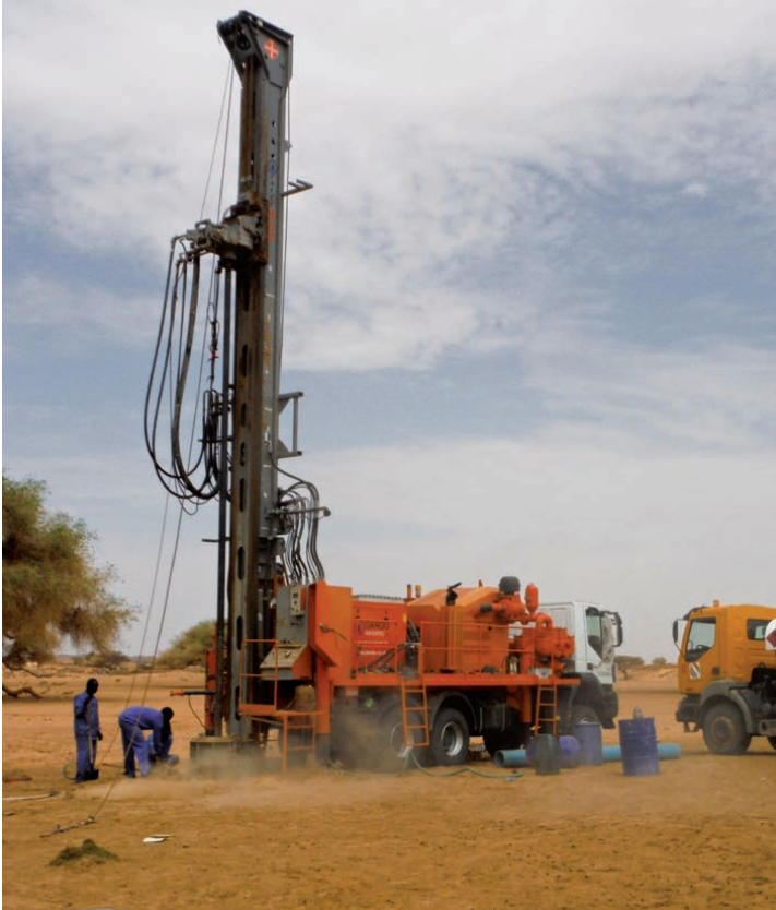
Capable of mud rotary, air and flooded reverse drilling techniques to great depths.